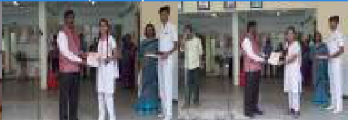
Winners in English and Hindi category Essay Writing competition of Mani Bhavan