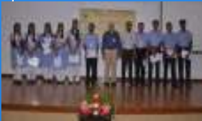
Winners in Extremore Vigilance Awareness NPOL