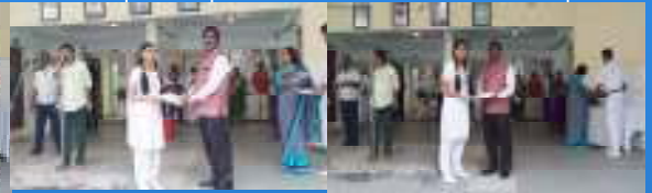
Winners in Marathi and Eng. Category elocution compl. Of Anti Dowry, Bombay