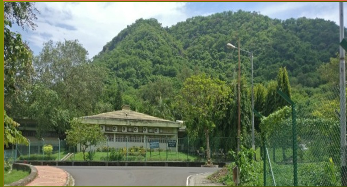
ATOMIC ENERGY JUNIOR COLLEGE ANUSHAKTINAGR, MUMBAI